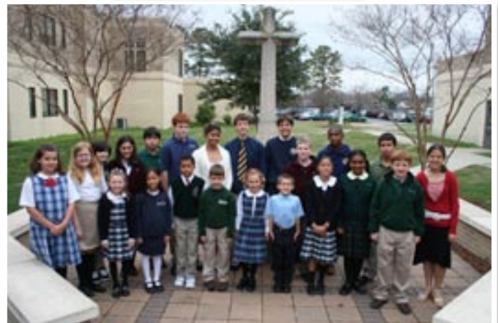
Students from all ten South Hampton Roads Catholic schools join together for a photograph in the courtyard at Bishop Sullivan CHS.

Check out the new website at www.hrcatholicsschools.com .